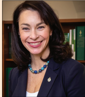
MP HEATHER MCPHERSON KEYNOTE ADDRESS

Critic for Foreign Affairs, Women and Gender Equality, Canadian Heritage and Deputy House Leader. Heather is the only non-Conservative Member of Parliament in Alberta. Prior to the 2019 election, Heather spent over 20 years working on sustainable development and international cooperation efforts through the non-profit sector, including ten years as Executive Director of the Alberta Council for Global Cooperation. Heather has worked closely with the Canadian and international community, focusing on sustainable development, good governance, and human rights. Heather has a master’s degree from the University of Alberta in Educational Policy Studies in Theoretical, Cultural, and International Studies in Education, with a focus on incorporating indigenous knowledge in the achievement of sustainable development. Heather lives in Edmonton, Alberta, with her partner and two children, where she takes full advantage of the proximity to lakes, forests, and mountains.