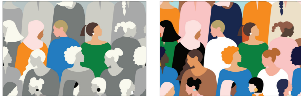
LEAVING NO ONE BEHIND